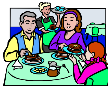
FUN WITH FAMILY & FRIENDS

What do all these things have in common? They represent RCP's first Fund-Raising Event for the year! Please mark your calendars for SATURDAY, MAY 15 th , 2010 , to come and join in the fun at Applebee's Restaurant on the 5 th Street Highway, for an All You Can Eat Pancake Breakfast . Tickets are $6.50 for Adults, and $4.50 for Children . You will be seated and served by the smiling faces of people from RCP, so help us raise money and have a filling breakfast at the same time.