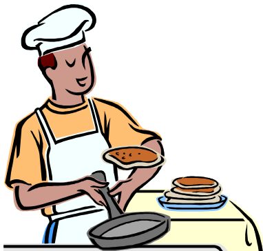
CHANCE TO HELP